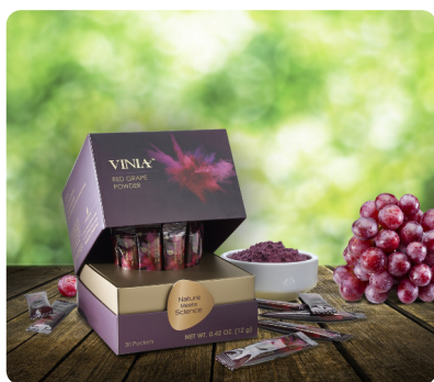
VINIA Red Grape Powder www.bioharvest.com

Mrs. Prindable's has mastered the art of the chocolate caramel apple. (They also bring their A-game when it comes to handmade confections like, chocolate and caramel covered pretzels, chocolate truffles, Chicago-style toffee, caramels...) Their gift baskets and boxes are wonderful gifts for every occasion. Perfectly packaged, they're goodies are so fresh and tasty, they guarantee 100% satisfaction. Send your sweetheart their Valentine Petite Caramel Apple Two-Pack, which comes with one dark chocolate and one milk chocolate apple imprinted with XOXO or LOVE candy hearts. Their famous decadent caramel is buttery and smooth, and make these apples incomparable. $19.99