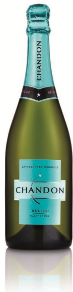
D lice by Chandon www.chandon.com

D lice—which translates to delicious in French—(it indeed is!) is the newest cuv e brought to you by CHANDON. This refreshing semi-sweet bubbly is perfect to sip during dinner, with brunch, while on a picnic, at the beach, under the moonlight... really, it's perfect for any celebration. What's a celebration without some bubbles? It's delicious served chilled or in their signature drink: California Spritz. Simply pour over ice, add a splash of sparkling water and garnish with mint, pink grapefruit or cucumber. Cheers! $22